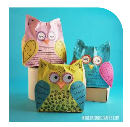
Paper Bag Owls