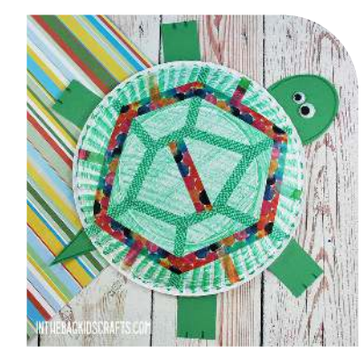
Paper Plate Turtle