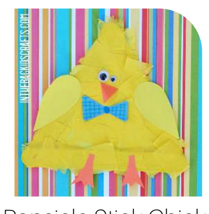
Popsicle Stick Chick