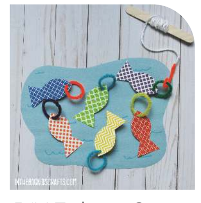
DIY Fishing Game