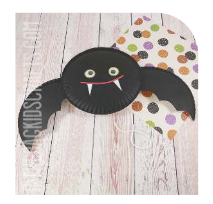
Flying Bat Craft