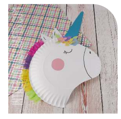
Paper Plate Unicorn