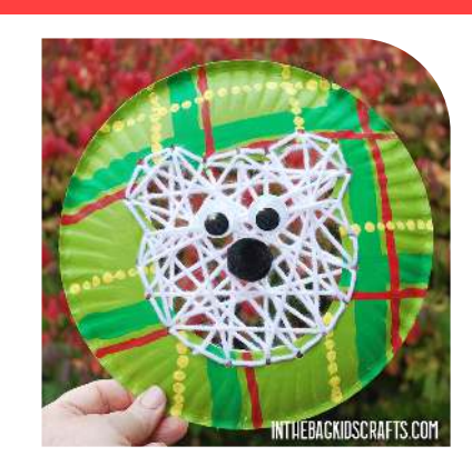
<u>Weaving Polar Bear</u>