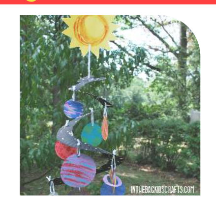
Solar System Mobile