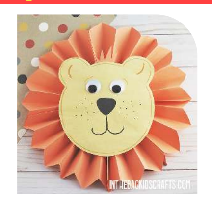
Paper Lion Craft