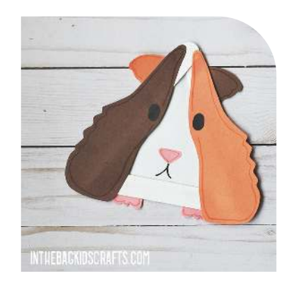
Triangle Guinea Pig