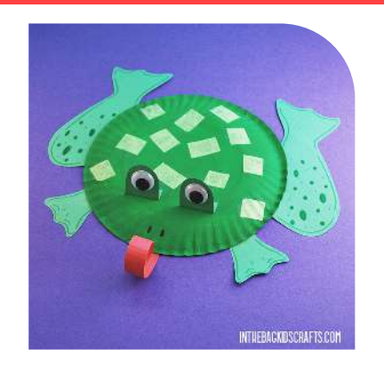
Paper Plate Frog