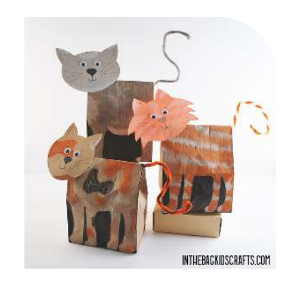
Paper Bag Cats