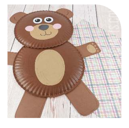
Paper Plate Teddy