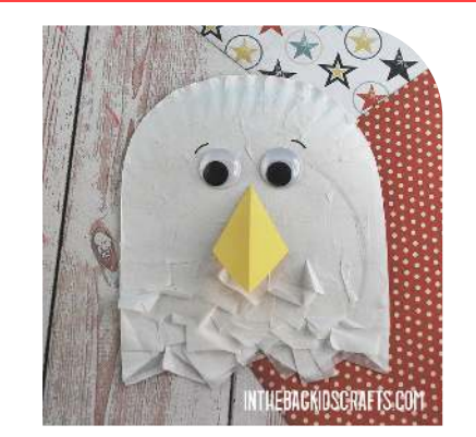
Bald Eagle Craft