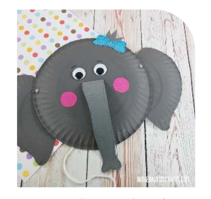
Paper Plate Elephant