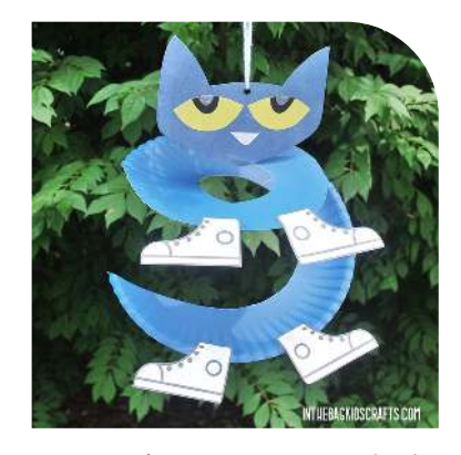
Pete the Cat Mobile