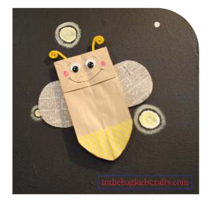
Paper Bag Firefly