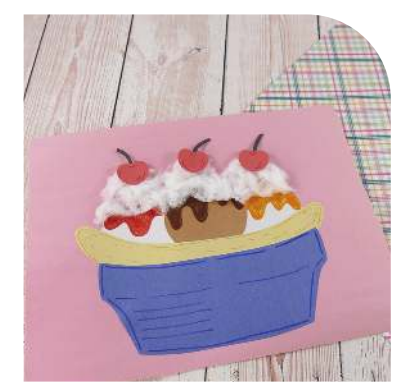
<u>Ice Cream Sundae</u>