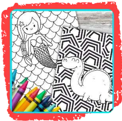
Coloring Pages Bundle

Thank you so much for purchasing this craft template! Here are some other popular printables you are going to love. Click on any of the pictures to learn more.