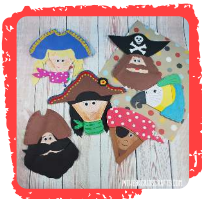
Clothespin Craft Animals