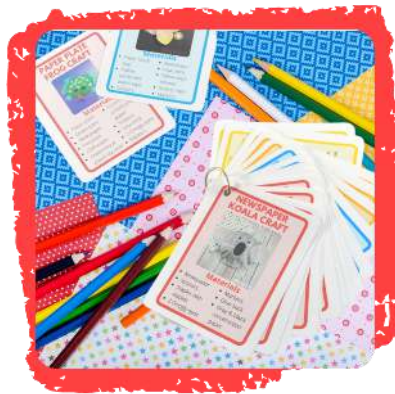
100 Craft Flashcard Sets