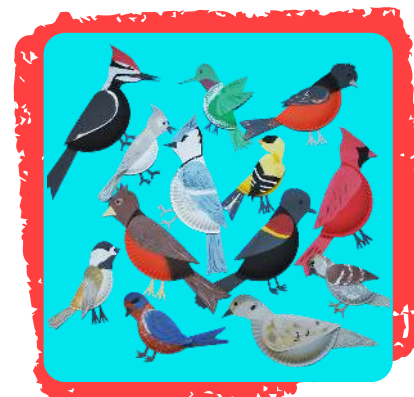
Paper Plate Bird Crafts